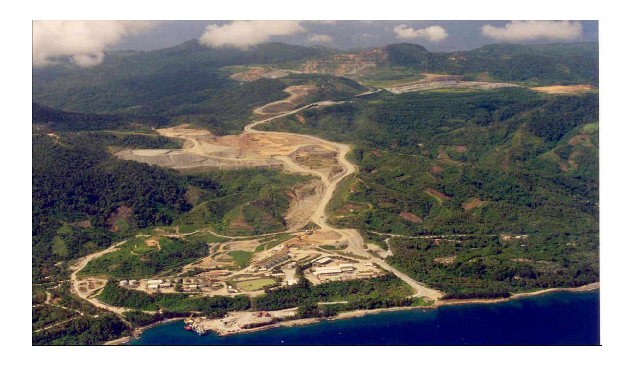
Figure 7.2: Aerial Photograph of the Misima Mine Plant Site.