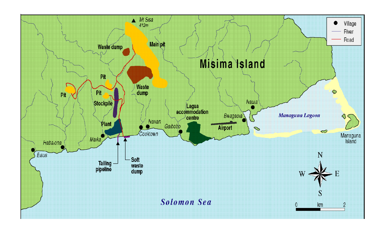
Figure 7.1: Map of Misima Island Showing Location of the Mining Operation.