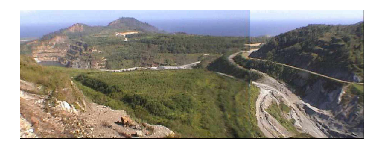
Figure 7.4: View from Mt. Sisa Showing Revegetated Pits and Dumps.